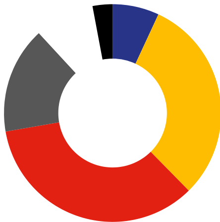
Where our funds come from

Our work is funded by corporate sponsorship, membership fees, income from events and donations. Other than our running costs all our funds are spent on our scholarship programme, hosting events and publishing La Revista.