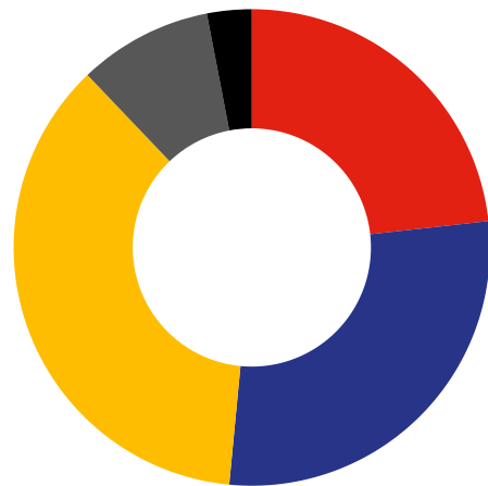
How we spend them